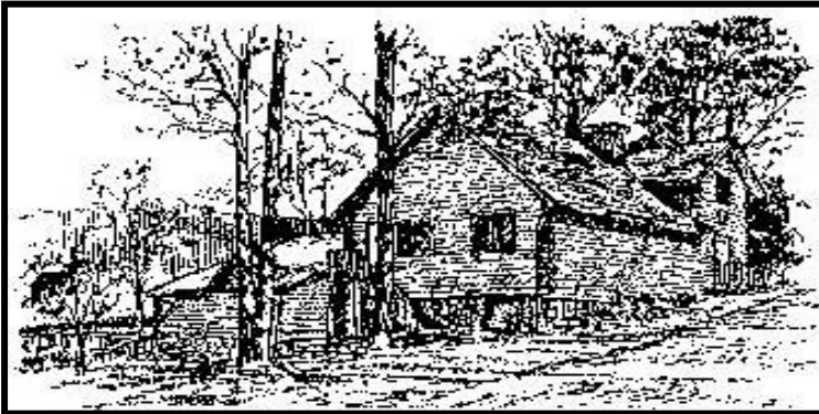
B.U.L Cabin Lake Telemark, New Jersey Pen and Ink Sketch by Don Tripp '94

Volume 16 issue 7 NOR-BU LODGE SUPPORTS A DEMENTIA FRIENDLY SOCIETY